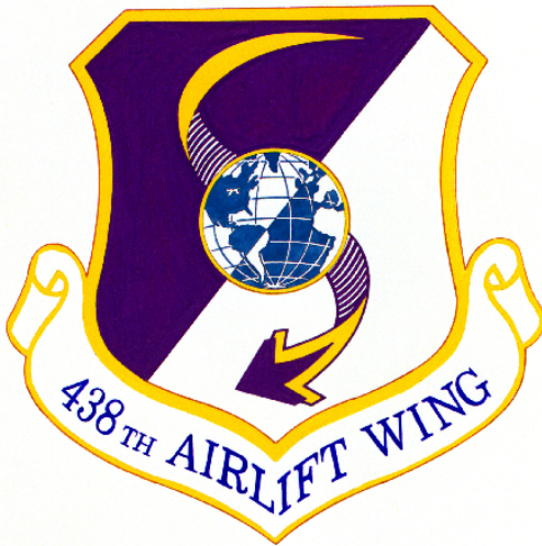
438 th Airlift Wing emblem

438 th Air Expeditionary Wing emblem: Per bend sinister Purpure and Argent, a globe per bend sinister Argent and Azure, land masses and grid lines counterchanged, fimbriated Or, in base a flight symbol of the first point to dexter emitting an 'S' shaped ribbon contrail Yellow, fimbriated Purpure, doubled White barry Purple palewise behind the globe, all within a diminished bordure Or. Attached below the shield, a White scroll edged with a narrow Yellow border and inscribed "438TH AIR EXPEDITIONARY WING" in Blue letters. Ultramarine blue and Air Force yellow are the Air Force colors. Blue alludes to the sky, the primary theater of Air Force operations. Yellow refers to the sun and the excellence required of Air Force personnel. The shield division suggests night and day and denotes the unit's ability to conduct operations twenty-four hours a day. The globe symbolizes the global mission of the unit and emphasizes the ability to complete the mission anywhere in the world. The lashing spear, with twisting contrails, symbolizes the speed and accuracy of the Group's combat capability. (Approved August 19, 1993 and modified on January 28, 2009)